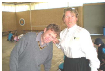
Bruce Bogtrotter and Miss Trunchbull

As the term draws to a close our students are showing enormous energy. In recent weeks we have moved quickly from producing outstanding performances on the athletics track to disguising ourselves as our favourite Roald Dahl character. In between we have celebrated wonderful NAPLAN results with many students scoring well above both school and national averages. I hope you enjoy the stories our students wrote after the Roald Dahl assembly and parade. It was a day of extremely creative classroom activities with many